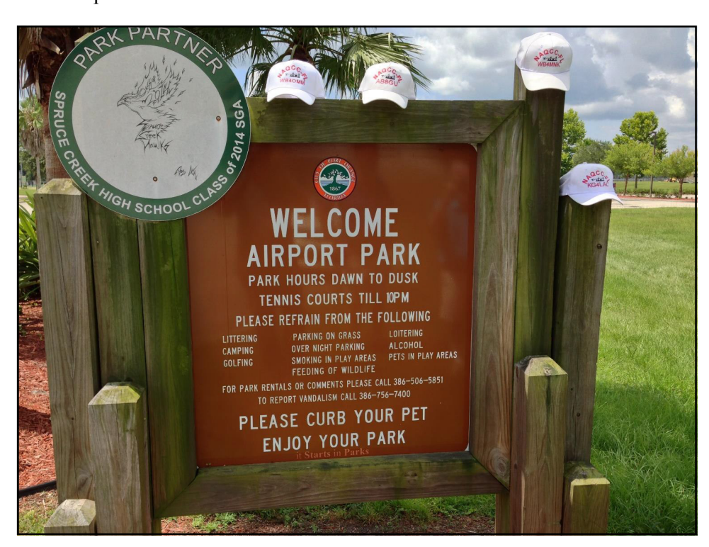
"Hats off to NAQCC-FL"