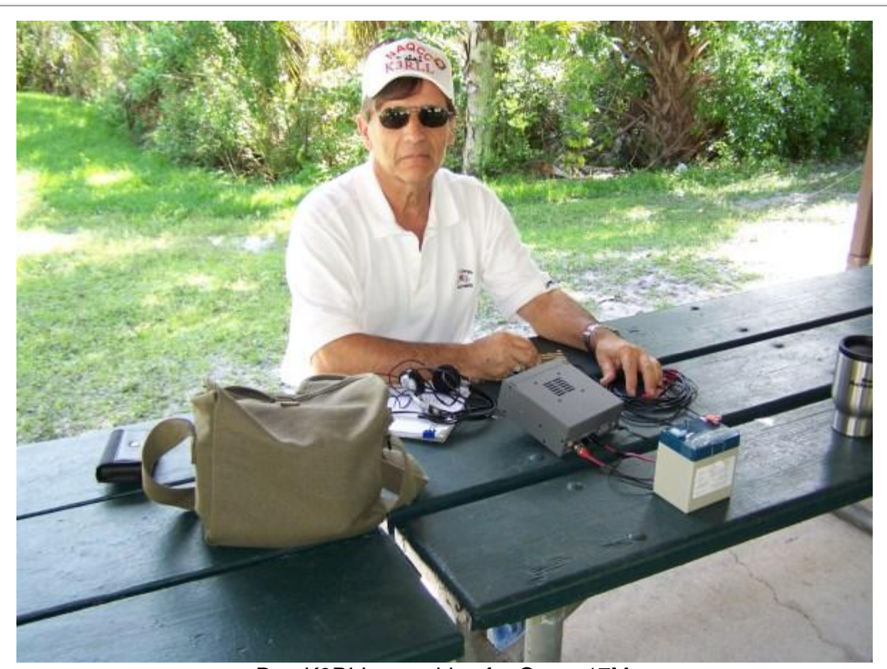
Don K3RLL searching for Qs on 17M