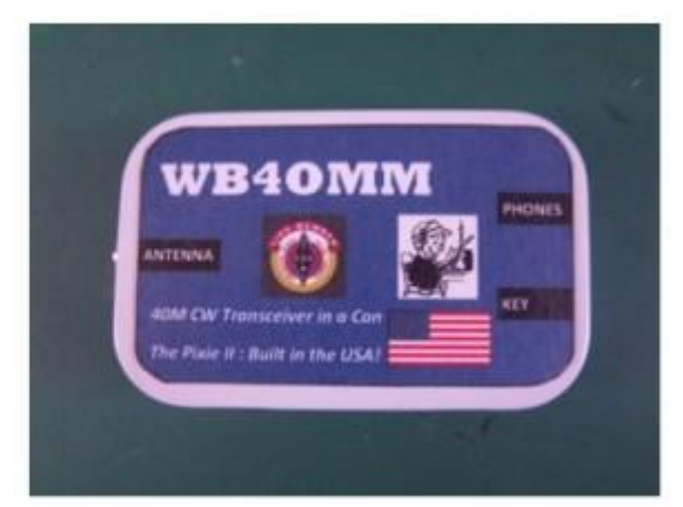
The Pixie II 40M transceiver that wouldn't work! IT WILL BE BACK! (About 450mW of power - built into an Altoids can and powered by a 9v Battery!)