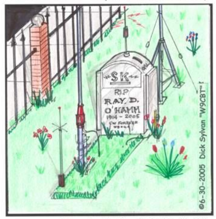
"Who Said You Cant Take It With You?"