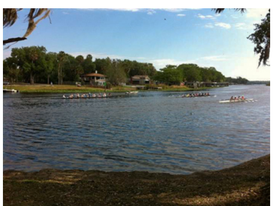
View across the channel to the 'mainland'

Watching us menacingly from the nearby water was this particularly large 'gator