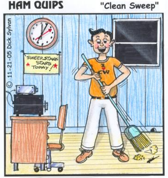
Hoping For A "Clean Sweep" In The Sweepstakes Contest, Rudy Sweeps Up The Floor Of The Ham Shack.