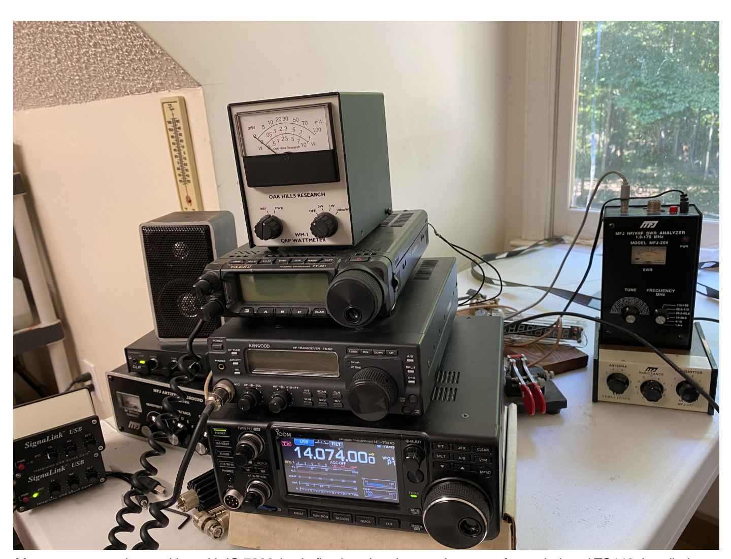
My current operating position with IC-7300 (main fixed station rig, a replacement for my beloved TS440 that died recently after nearly 40 years), old TS-50, and FT-891. Various other accessories can be seen for tuning, digi modes, etc.

Through long years of school and work, there were times when I was not on the air at all. There were also times I lived in apartments, and I often got on the air with some interesting antennas. I plan to share about that through some future articles here in this newsletter.